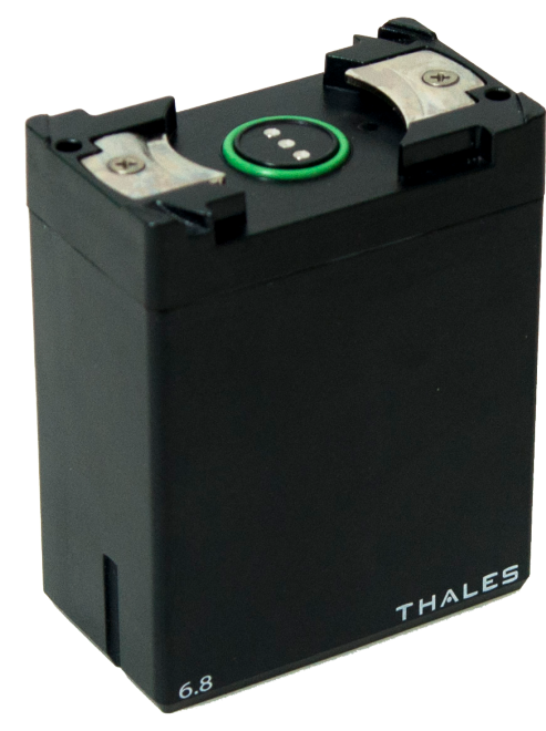
*Notes: A Material Safety Data Sheet [MSDS] is not required for this part based on a Class 9 100Wh limit. This document can be used as a Product Safety Data Sheet [PSDS].